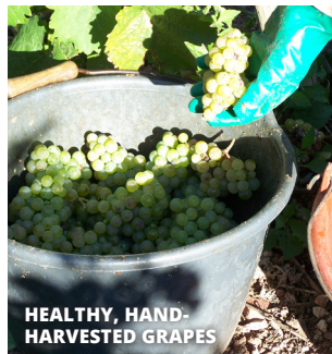
HEALTHY, HAND-HARVESTED GRAPES