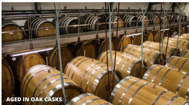
AGED IN OAK CASKS