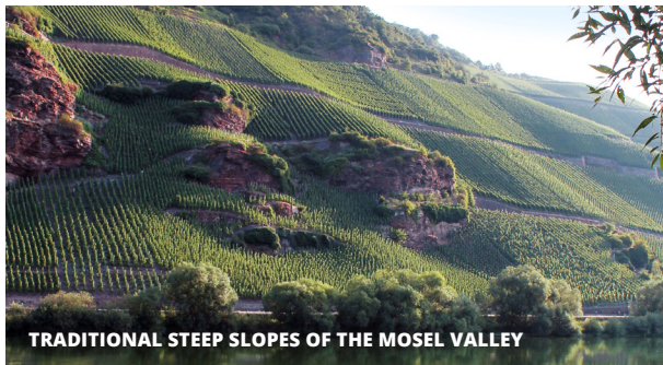
TRADITIONAL STEEP SLOPES OF THE MOSEL VALLEY